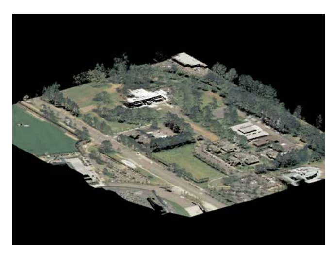
GEOVIA Surpac's offers native point cloud support reducing the number of solutions you need to use and maintain.