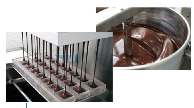
With BIOVIA you can manage all the equipment used for the production of your confectionary.

The manufacturing of confectionary requires a large array of specific equipment like mixers, heaters and molds. For manufacturing of the final products it is complex to manage all this equipment, mainly the large amount of molds required. BIOVIA can help to get an easy overview of the availability and location of these devices with a catalogue. This helps streamlining the process and saves time searching or waiting for specific equipment to be available.